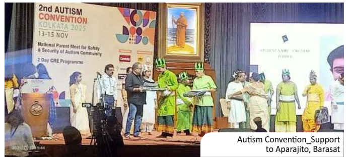
Autism Convention_Support to Aparajito, Barasat