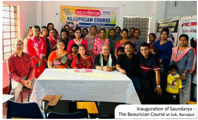
Inauguration of Saundarya - The Beaurician Course at Suk, Baruipur