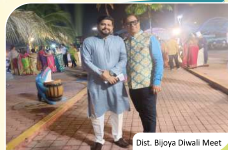
Dist. Bijoya Diwali Meet

Special Classes at Green Leaves School – 20th November, 2025 – SP