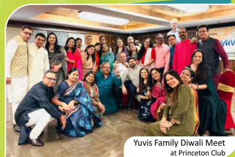
Yusis Family Diwali Meet at Princeton Club

"We meet every Friday at 7 PM at EITMA, Oswal Chambers, 5th Floor, 2 Church Lane, Kolkata - 700001".