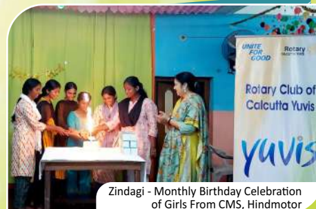
Zindagi - Monthly Birthday Celebration of Girls From CMS, Hindmotor