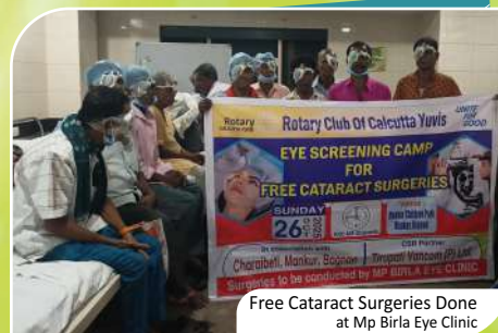
Free Cataract Surgeries Done at Mp Birla Eye Clinic