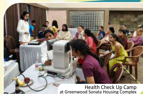
Health Check Up Camp at Greenwood Sonata Housing Complex